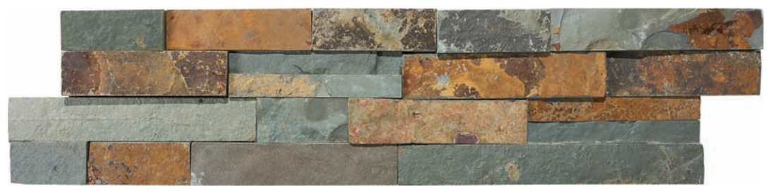
6" x 24" SIERRA LEDGESTONE 76-326 6" x 24" SIERRA LEDGESTONE CORNER 76-327

6" x 24" BEACHWALK LEDGESTONE 76-324 6" x 24" BEACHWALK LEDGESTONE CORNER 76-325