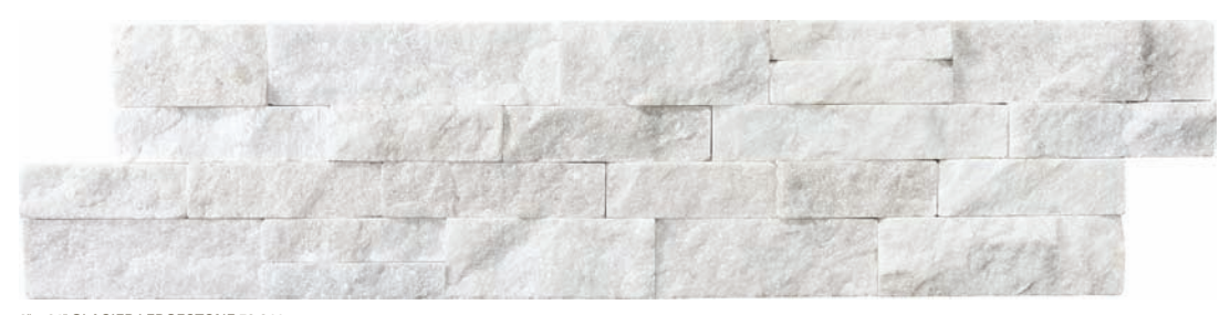
6" x 24" GLACIER LEDGESTONE 76-344