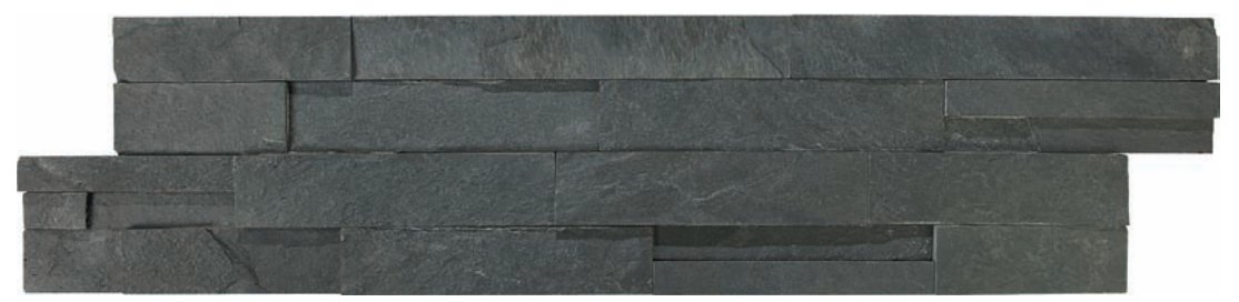
6" x 24" CARBON LEDGESTONE 76-328 6" x 24" CARBON LEDGESTONE CORNER 76-329